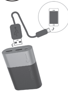
Charging your device